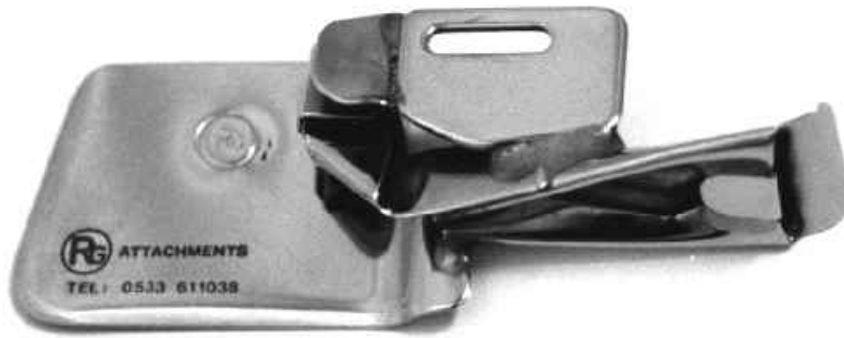
Flat Bed Machine

EXTRA LIGHT, LIGHT, MEDIUM, MEDIUM HEAVY