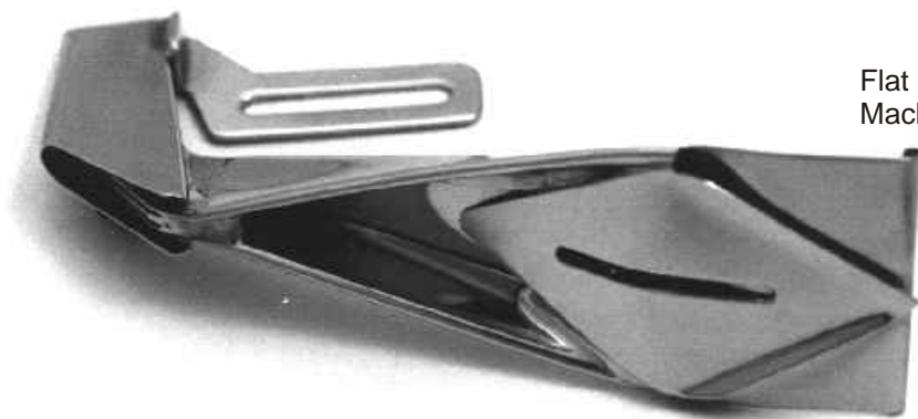
Flat Bed Machine

EXTRA LIGHT, LIGHT, MEDIUM, MEDIUM HEAVY