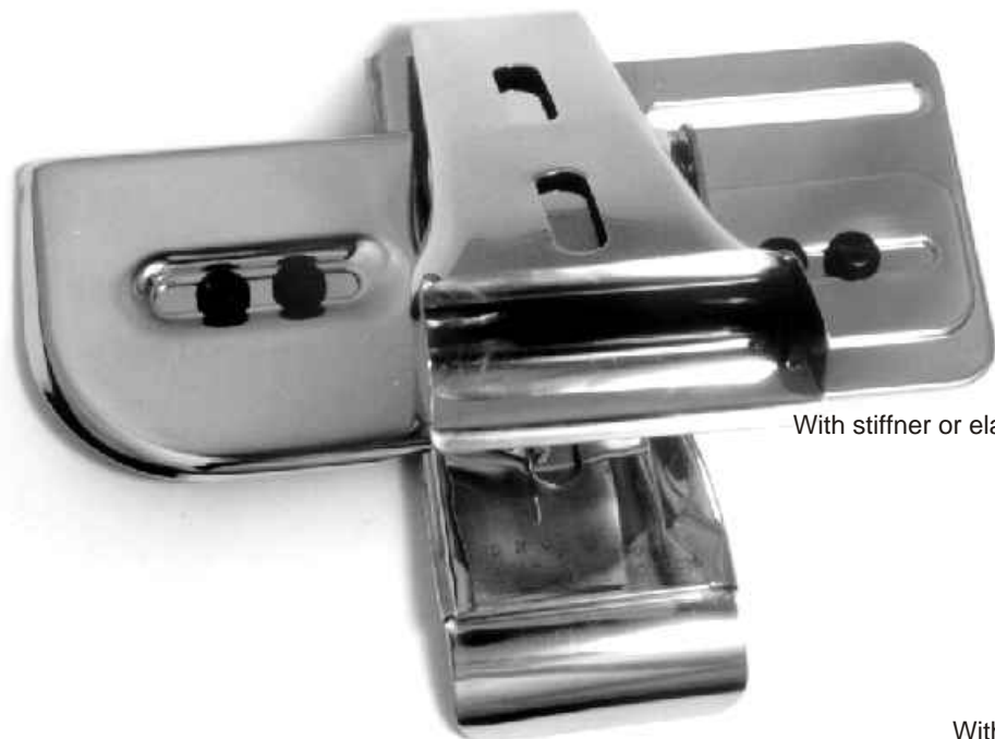
With stiffner or elastic

EXTRA LIGHT, LIGHT, MEDIUM, MEDIUM HEAVY, HEAVY