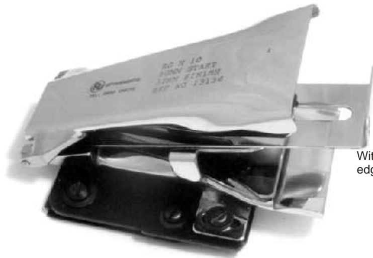
Without adjustable edge guide

EXTRA LIGHT, LIGHT, MEDIUM, MEDIUM HEAVY, HEAVY