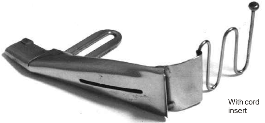
With cord insert

EXTRA LIGHT, LIGHT, MEDIUM, MEDIUM HEAVY